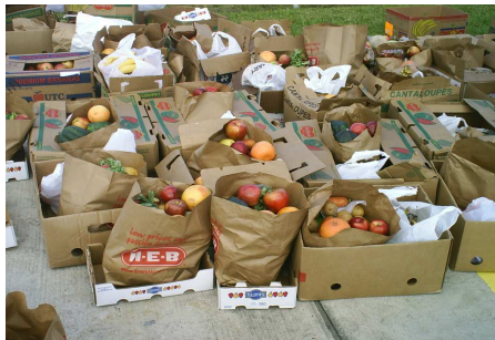
The produce given away in April.

For those who are not sure what 2nd Saturday Celebration is let me tell you. It is a bridge for the community. It is a way for God's people to get a taste of local churches. Some people don't feel completely comfortable walking into a church and this is a way for them to find a church that they would be comfortable going.