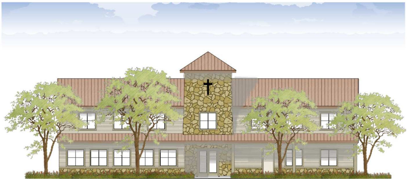
An Artistic rendering of our New Building